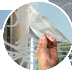
Peel Away Spray Paint, Markers, Etching & Scratches