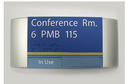
Photopolymer Architectural Braille