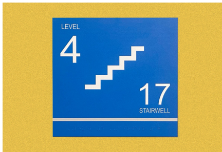
3D Flat Bed Digital Printed Signs