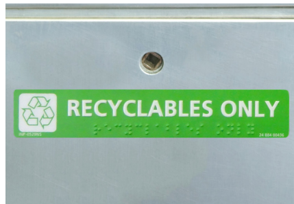
Embossed Polycarbonate Lexan